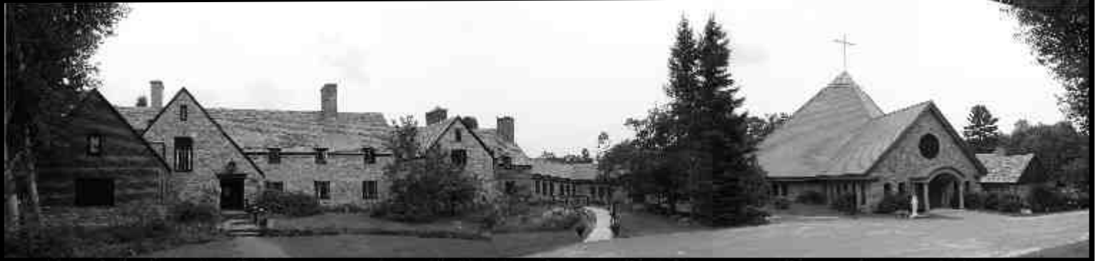
St. Scholastica Priory, 271 North Main Street, PO Box 606, Petersham, MA 01366